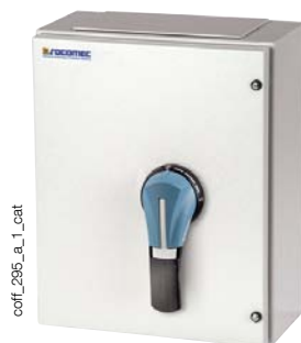
SIRCO in polyester enclosure